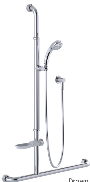
Drawn LH (Left Hand)